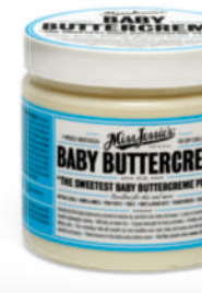
MISS JESSIE'S Baby Buttercreme ($32, missjessies.com).