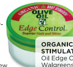
ORGANIC ROOT STIMULATOR Olive Oil Edge Control ($5, Walgreens stores).