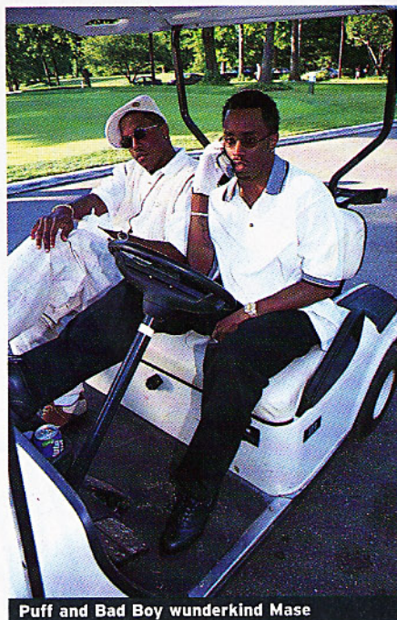
Puff and Bad Boy wunderkind Mase

Combs used to watch LL, and now, in a sweetly ironic twist, LL is taking direction from him. They're at the Bad Boy studios, Daddy's House, in midtown Manhattan. LL's in the sound booth. Combs is at the controls. He's getting impatient, telling LL he's not emphasizing the right shit. LL's like, "Okay, but sometimes I'm not even thinking about the words, I'm just, you know," and then he blows out a thin