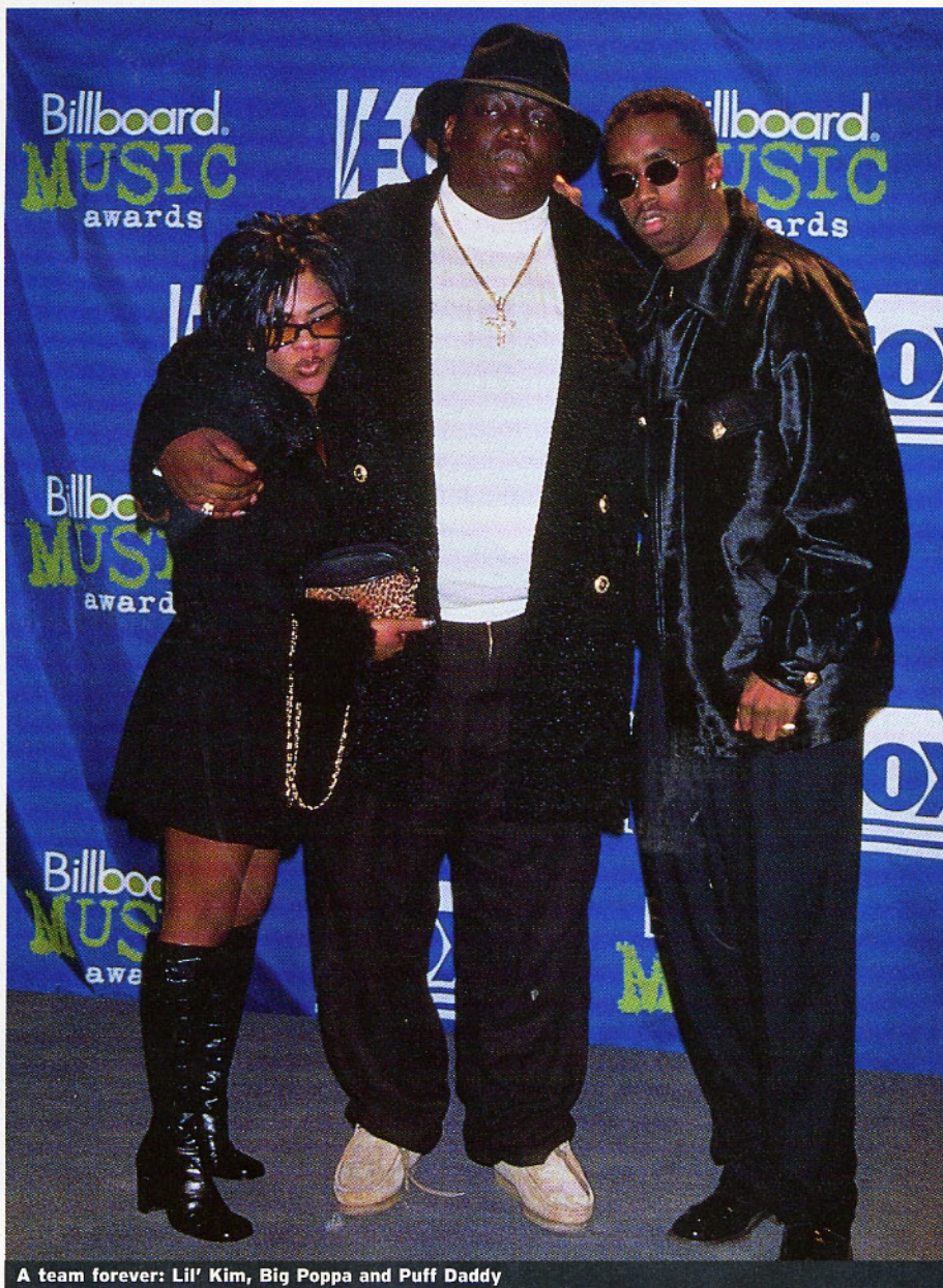
A team forever: Lil' Kim, Big Poppa and Puff Daddy

Combs' got jokes galore. But sometimes he doesn't know if that shit, the laughter, is real. "When I'm making a joke, a lot of times everybody's laughing. But a lot of times I think somebody can be laughing just because I'm the leader. Sometimes I just want to be part of the gang."